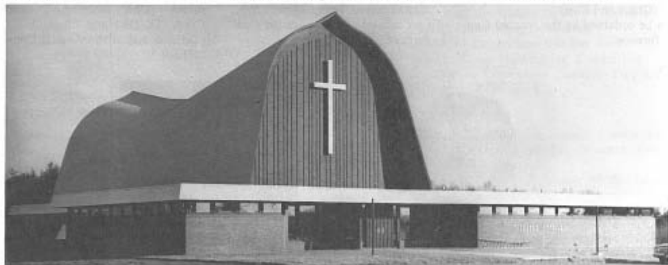
St. Paul's Lutheran Church, Cloquet, Minnesota, host church to the Annual Conference, and site of all the convention sessions.